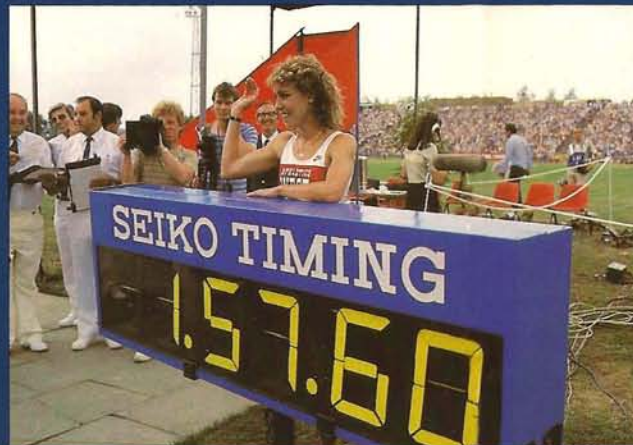
Seiko's long-term timing programme covers AAA and BAAB events.