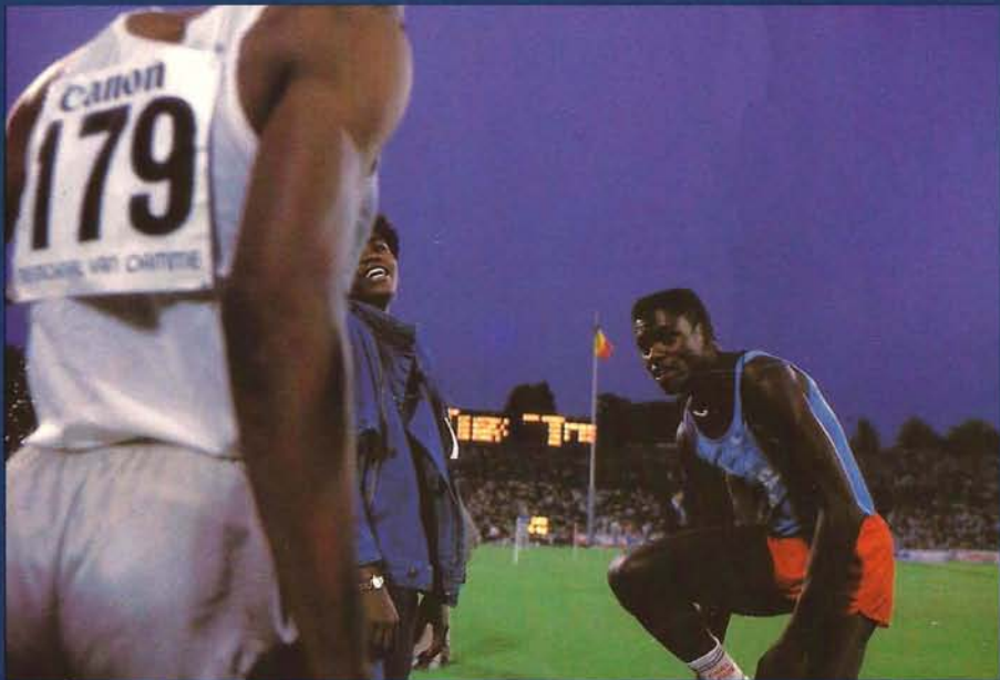
A programme of selected permit meetings reaching specific target markets attracts sponsor investment.

By every criterion, the first World Championships was a huge success. The most commercially successful new event in the history of sport — the most popular with spectators.