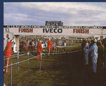
West Nally were marketing consultants to the '83 World Cross Country Championships.