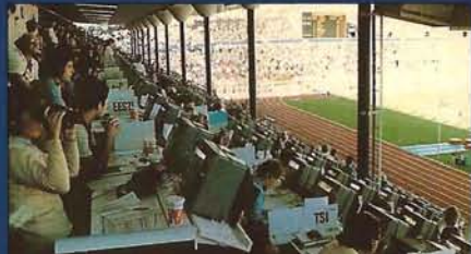
West Nally works with organising committees to expand the television coverage of events.