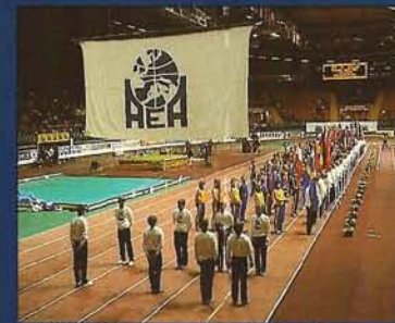
With the EAA, we look after key European athletics programmes.